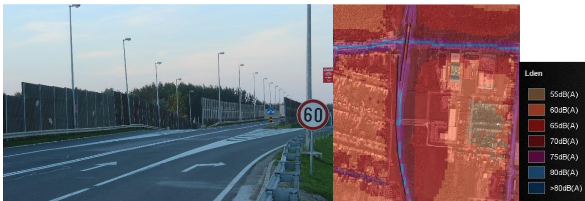
Figure 3 a) Noise barrier on west bypass and b) the effect of the noise barrier on noise levels

So far in Osijek, the only physical noise protection planned and built is on the western bypass at the junction with the Višnjevac suburbs (Figure 3, left): a noise barrier built from metal pillars with transparent and wooden panels. Transparent panels were used on the overpasses, and wooden panels were used in areas where the barrier rests on the embankment. On the eastern side, the barrier only covers the overpass because it is meant to protect the industrial/business zone; on the west side, next to the Višnjevac suburbs, the barrier is much longer because it protects the residential areas. Figure 3 shows this wall and its effect on the noise map.