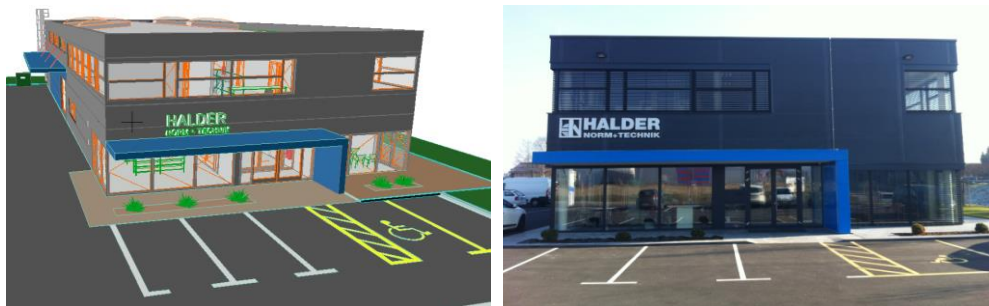
Figure 6 BIM model and completed business-storage facility in Hoče [60]

The final example of good BIM practice reviewed here was a 6D model applied to covering maintenance planning for a business-storage facility located in Hoče [59]. The developed 6D BIM was intended to be a service-book for the constructed object, including all required maintenance activities and related costs from the beginning of usage to the end of the projected lifecycle. The BIM model and completed business-storage facility are shown in Figure 6.