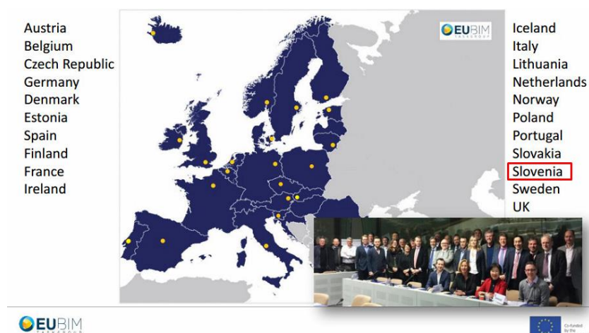
Figure 3 Members of EU BIM Task Group [53]

The inclusion of Slovenia in the EU BIM Task Group, which currently contains 21 members within the frame of European Commission (see Figure 3), represents yet another important milestone in furthering the introduction of BIM. The primary intention of this group is to unite national endeavors into a common and harmonized European methodology to digitalize the construction industry [53].