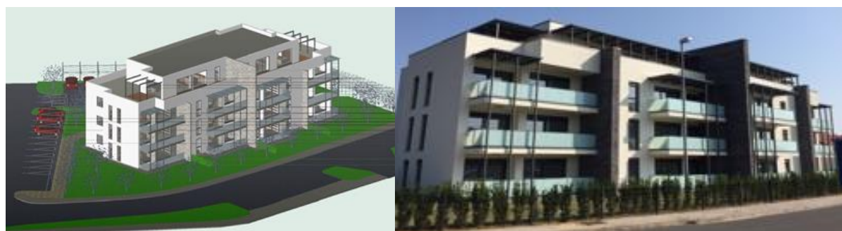
Figure 4 Modeled and completed residential block in Ljutomer [56]

Construction on the residential block in Ljutomer [55] utilized BIM to create variant 4D and 5D models relating to optional technologies for building external walls. The objective was to determine the most suitable solution for building from the perspectives of construction duration, costs, and energy savings. The outputs of the project demonstrated that such BIM models are particularly useful in preliminary project phases. The modeled and completed residential blocks in Ljutomer are presented in Figure 4.