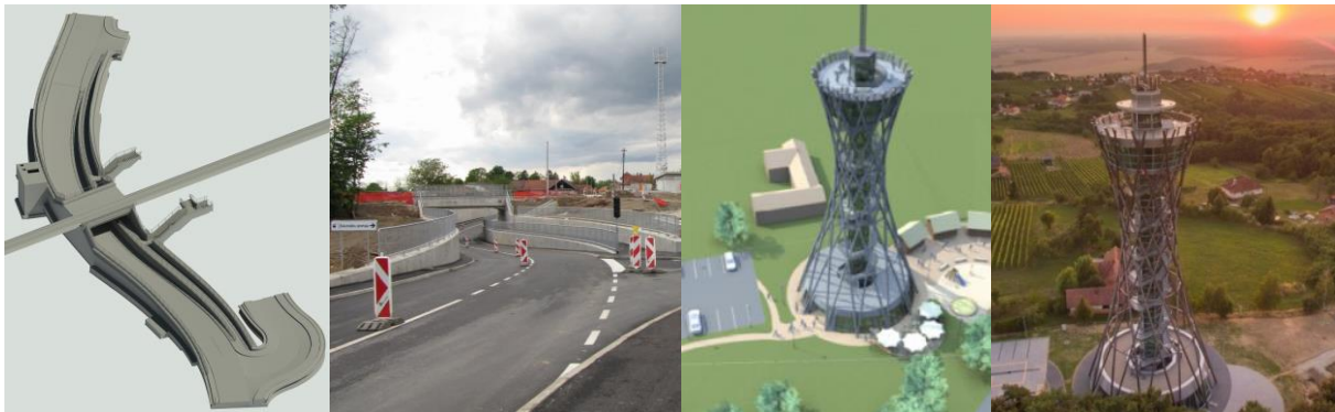
Figure 2 Grlava underpass (DEGRIP project) [46] and Vinarium Tower (jaBIM project) [47]

Mutual collaboration between universities and industry quickly revealed the requirement for an integrated BIM approach in construction operations. For instance, some early BIM-based projects such as DEGRIP [46] and jaBIM [47] were even supported by Slovenian Human Resources Development and Scholarship Fund, which acts within the European Social Fund framework. The outputs of the DEGRIP project provided 3D and 4D models for underpasses in Grlava and Ljutomer, whereas the implementation of the jaBIM project provided a BIM model for the Vinarium Tower in Lendava containing equal informational dimensions (see Figure 2).