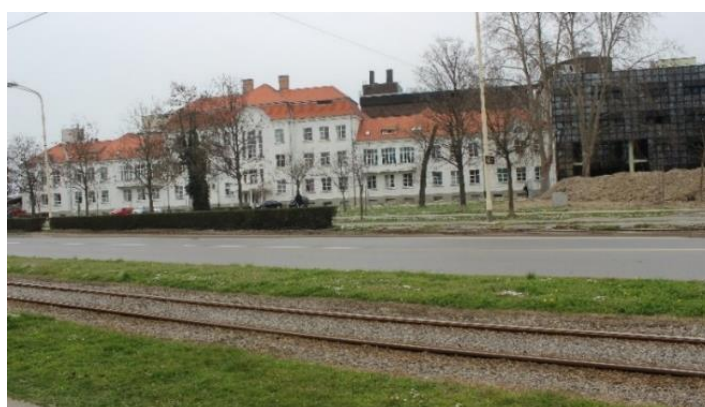
Figure 9 Area between campus and Osijek hospital

Along Cara Hadriana Street and European Avenue, near Osijek Clinical Hospital (Figure 9), the health care center, and the university buildings, noise levels could be reduced by choosing adequate trees and bushes of appropriate type. Extra peace and quiet near the hospital and campus could be obtained by constructing low barriers along the tram track, described in [16].