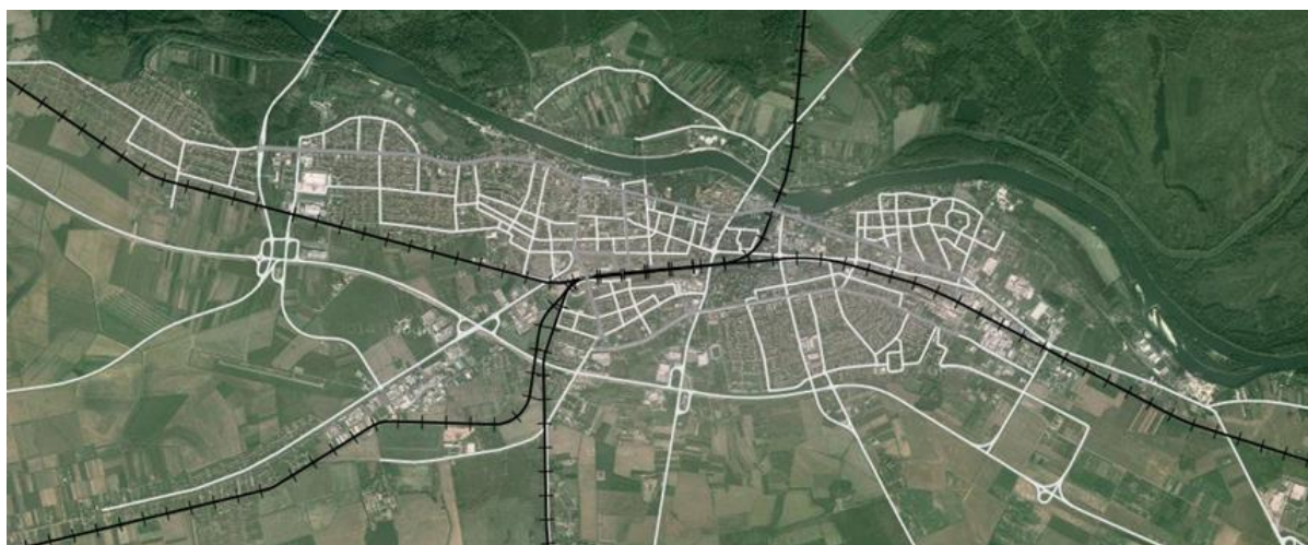
Figure 1 Traffic network of Osijek

Road transport with the longest traffic network affects the greatest number of people by the noise it produces. Noise levels shown through L_{den} exceed 55 dB in most residential areas, climbing to 70–80 dB in areas surrounding streets with high traffic volume (Figure 2). Even at night, noise levels are much higher than permissible: the larger city streets have noise levels as high as 65–70 dB. The streets with the most traffic noise are also the busiest city roads, which connect the city in longitudinal and transverse directions, linking areas on the verge of the city and the suburbs (Figure 2).