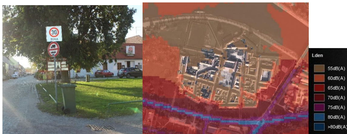
Figure 5 a) Noise abatement measures and b) noise levels in Tvrd̑a

Noise has been reduced in some parts of the city through other measures not focused on noise reduction, such as speed limits, traffic bans on certain types of vehicles, and suitable urban planning. For example: the streets in the old part of the city, Tvrd̑a, are paved with small stone cubes, which can generate considerable noise. Noise has been limited here through several measures introduced because of safety, pavement structure, and capacity. Some of the traffic areas, along with a central square, have been turned into pedestrian-only zones, while in other parts the car speed has been limited to 30 km/h and trucks and heavy vehicles have been prohibited (Figure 5, left). The high noise levels of European Avenue, located south of Tvrd̑a, have been attenuated by a green belt, but they have been reduced more so by the massive buildings around the perimeter. Figure 5 shows a noise map of the area, revealing the effect of these measures. It should be noted that these noise maps do not include noise from bars and clubs, though this noise can dominate on the weekends during the evening and night.