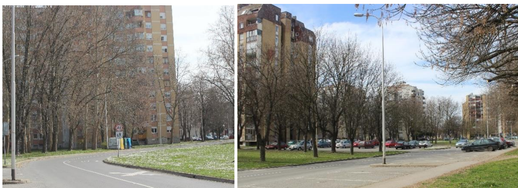
Figure 6 The settlement of Sjenjak