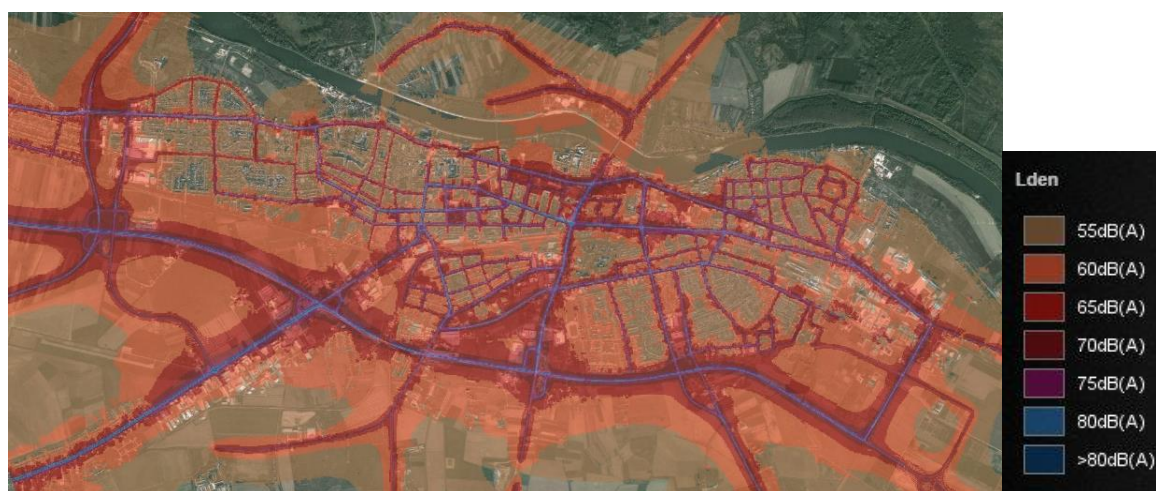
Figure 2 Daylong ( L_{den} ) noise levels from road traffic

Road transport with the longest traffic network affects the greatest number of people by the noise it produces. Noise levels shown through L_{den} exceed 55 dB in most residential areas, climbing to 70–80 dB in areas surrounding streets with high traffic volume (Figure 2). Even at night, noise levels are much higher than permissible: the larger city streets have noise levels as high as 65–70 dB. The streets with the most traffic noise are also the busiest city roads, which connect the city in longitudinal and transverse directions, linking areas on the verge of the city and the suburbs (Figure 2).