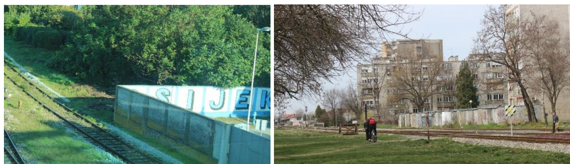
Figure 10 a) Existing barrier at railway station and b) areas along the railway where barriers are necessary

Noise near the railway station should be solved by planting vegetation and constructing barriers, which have already been constructed for safety reasons in one location (Figure 10, left). To further reduce noise, an absorbing surface could be applied to the existing barrier. Constructing barriers is especially convenient in areas where the rail passes close to residential areas. At the location shown in Figure 10 (right), as in many others, constructing barriers would be particularly appropriate because they would not only reduce noise but also improve safety by preventing uncontrolled crossing over the tracks.