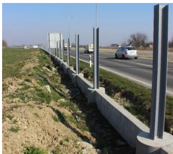
Figure 4 Noise barrier during construction

Noise has been reduced in some parts of the city through other measures not focused on noise reduction, such as speed limits, traffic bans on certain types of vehicles, and suitable urban planning. For example: the streets in the old part of the city, Tvrd̑a, are paved with small stone cubes, which can generate considerable noise. Noise has been limited here through several measures introduced because of safety, pavement structure, and capacity. Some of the traffic areas, along with a central square, have been turned into pedestrian-only zones, while in other parts the car speed has been limited to 30 km/h and trucks and heavy vehicles have been prohibited (Figure 5, left). The high noise levels of European Avenue, located south of Tvrd̑a, have been attenuated by a green belt, but they have been reduced more so by the massive buildings around the perimeter. Figure 5 shows a noise map of the area, revealing the effect of these measures. It should be noted that these noise maps do not include noise from bars and clubs, though this noise can dominate on the weekends during the evening and night.