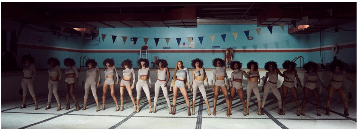
Picture 2. Beyoncé standing in formation with her coloured dancers in the “ Formation ” music video

A lot of girls in America still have problems fitting in the society because of their skin colour and someone like Beyoncé, who can greatly influence masses, can probably make a difference. “My persuasion can build a nation Endless power, with our love we can devour” (Beyoncé) “ Run the world ” is a song about women and unity of women. In a way she wants to address the issue that women are here and present and that man cannot mess with them so easily anymore. “Some of them men think they freak this like we do, but no they don't. Make your check, come at they