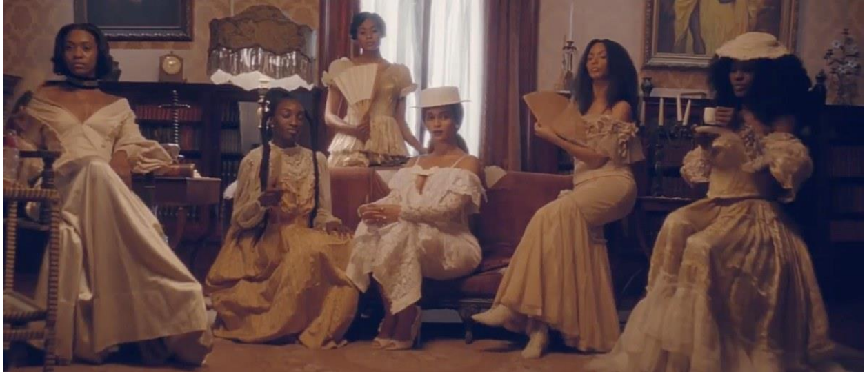
Picture 1. Beyoncé with some African American women in the “ Formation ” music video

through her lyrics and videos. Her whole band and dancers are African Americans. In the video for the song “ Formation ” it is especially vivid in the sense that she brought her daughter, along with some other famous African American women to stand together in a formation, to fight for their rights, to be equal.