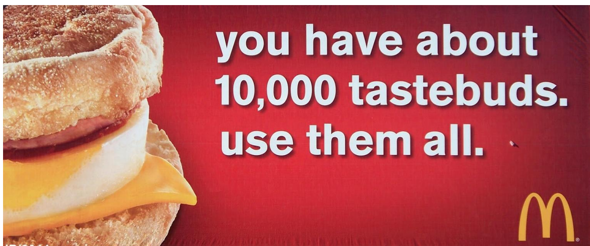
Picture 1: An example of soft sell advertising: McDonald's Egg McMuffin 1

There are different approaches to advertisement, like notions of soft sell and hard sell. A hard sell approach assumes that the consumer needs more information in order to purchase products or services, whereas soft sell approach is used where the impression is more important than the information (Louise 2014). While hard selling makes a direct appeal, soft selling relies more on mood than exhortation, and on the implication that life will be better with the product or service (Christelle 2012). In other words, with hard selling advertisers usually make imperative sentences to make a direct appeal to customers, and with soft selling they “set the mood” for buying a particular product or service, by appealing to customer’s needs, desires or motives. Many times the effect of soft sell is produced just by placing the brand or logo and a new product on the picture of a successful and beautiful woman or a handsome man (if we are trying to sell a perfume, for example). Therefore, there is no need to translate this kind of advertisements, but sometimes the pictures have to be adapted to the target market.