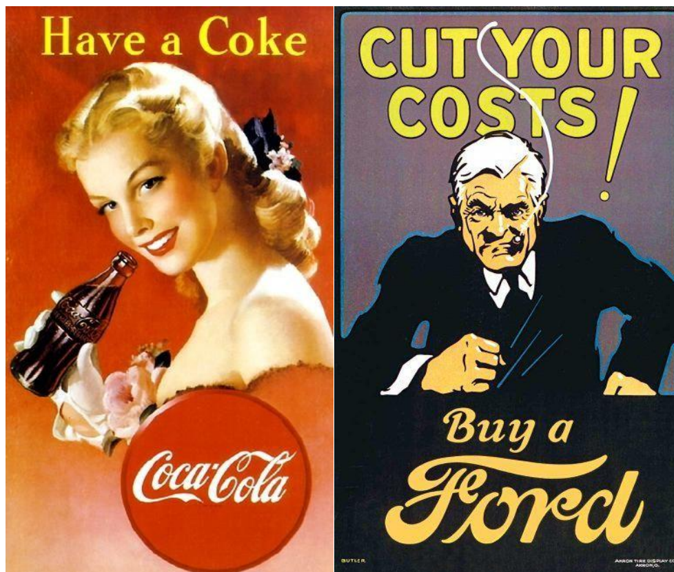
Picture 2: Examples of hard sell advertising: Coca Cola 2 and Ford 3

enjoy its taste more than by eating any other food. Even though this is an example of soft sell, it is visible how influential it can be in many levels. In some cases, it can be more effective than hard sell, because it draws people to try the product or service by appealing to their emotions of pleasure, happiness, comfort, love, etc. Advertisers often choose this way of advertising because it is less direct and the customers do not find it arrogant or bossy as hard sell adverts.