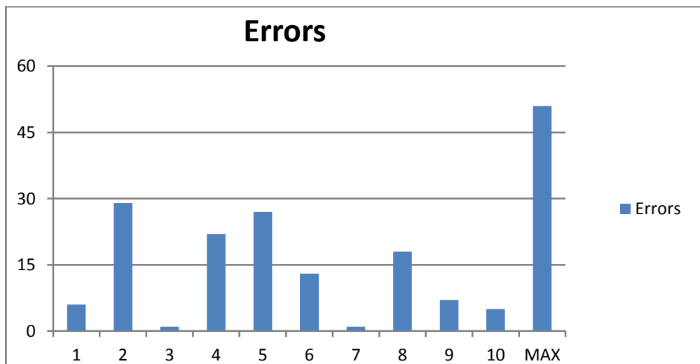
Figure 2: Errors in the second task of the questionnaire

The second task has 129 incorrect answers out of 510 answers in total, i.e. 25.29 %. The first sentence has 6 incorrect answers out of 51, which is 11.76%. The second sentence has 29 incorrect answers out of 51 which is 56.86%. The third sentence has only 1 incorrect answer out of 51 as well as the seventh sentence, which is 1.96%. The fourth sentence has 22 incorrect answers out of 51 which is 43.13%, the fifth sentence has 27 incorrect answers out of 51 which is 52.94%, and the sixth sentence has 13 incorrect answers out of 51 which is 25.49%. Eight sentence has 18 incorrect answers out of 51 which is 35.29%, the ninth sentence has 7 incorrect answers out of 51 which is 13.72%, and lastly, tenth sentence has 5 incorrect answers out of 51 which is 9.80%.