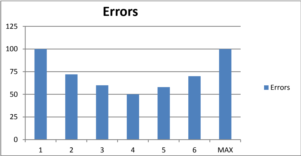
Figure 3: Errors in the third task of the questionnaire

The third task of the questionnaire has six sentences which means that it has 306 answers. 195 out of 306 answers are incorrect in this task which is 63.72%. Not one person managed to correct the first sentence so the percentage of errors is 100%. 14 persons out of 51 corrected the second sentence correctly which means there are 37 incorrect answers, i.e. 72.54%. The third sentence has 31 incorrect answers which are 60.78% of incorrectness. There are 26 out of 51 possible incorrect errors in the fourth sentence, which is 50.98%. 21 persons out of 51 managed to correct the fifth sentence so there are 30 incorrect answers which are 58.82% of incorrectness. The sixth sentence was corrected well 15 times which means there is 70.58% of incorrectness.