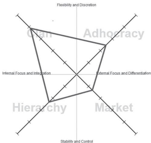
Figure 2. Surveyed students' preferences of the future employer's organizational culture

This means that they aspire to work in a company whose success is primarily the result of employee loyalty, tradition and mutual cooperation of all employees. Interpersonal relationships in companies with the clan organizational culture are based on caring for people (Cameron, 2004; www.ocai-online.com). Because of this, members of the clan culture tolerate the stresses of everyday business more easily, even the low salaries. In the clan culture, employees respect each other: workers see their managers more as mentors and management tends to take into account the opinion of all employees when making business decisions. In such companies, there is an overall atmosphere of mutual respect and support, which is actually the main source of job commitment of employees and their effectiveness. These results are presented in Figure 2 and Table 3.