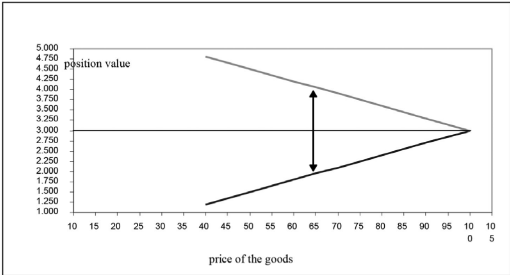
Figure 1 Simultaneous taking of opposite positions - offset