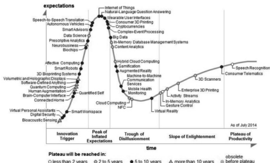
Figure 2 Gartner's Hype Cycle (2014)