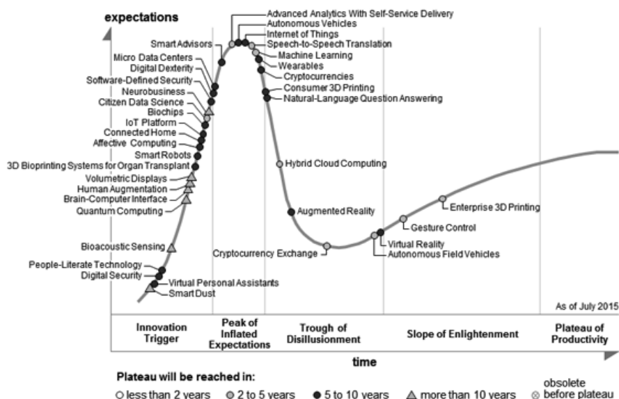
Figure 3 Gartner's Hype Cycle (2014)