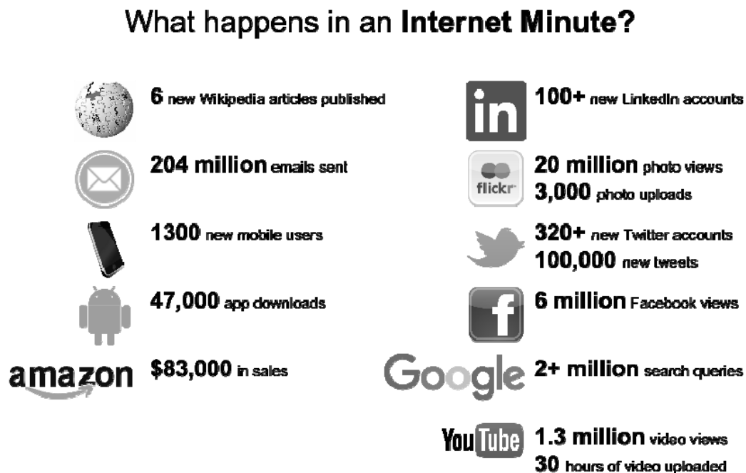
Figure 1 What happens in an Internet minute?