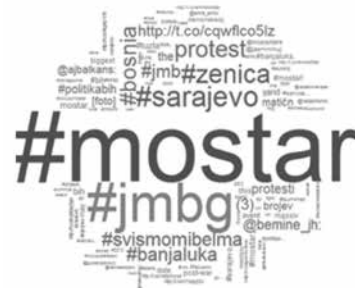
Figure 4 Sentiment analysis on Mostar as a destination

In the figure above the words that have the highest frequency in messages containing Mostar as a keyword are displayed. Since the word Mostar appears the most (in each message), that word has the largest font in the word cloud. Analyzing the word cloud it can be concluded that the words associated with Mostar as a destination are the following: old, bridge, beautiful, Bosnia, Herzegovina, photo, which suggests that Mostar in Herzegovina is a nice town where the Old Bridge is a historical element, where visitors like to take pictures. Of course, opinions of social network users depend on the point in time when the analysis is performed.