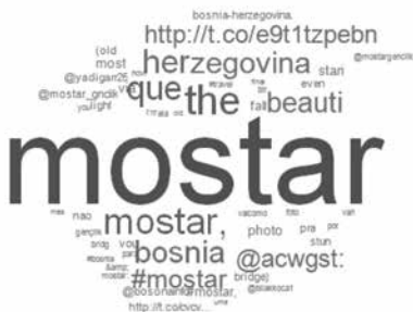
Figure 3 Word cloud analyses opinions on Mostar as a destination

>colWC <- brewer.pal(8,"Dark2") >wordcloud(m.d$word,m. d$freq,scale=c(8,.2),min.freq=4,max.words=Inf, random.order= FALSE, rot.per=.15, colors=colWC)