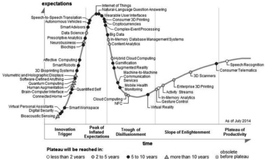
Figure 2 Gartner's Hype Cycle (2014)