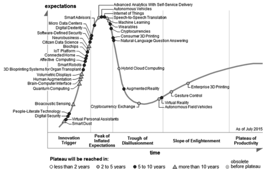
Figure 3 Gartner's Hype Cycle (2014)