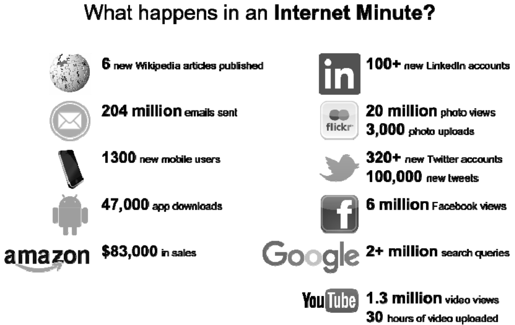
Figure 1 What happens in an Internet minute?