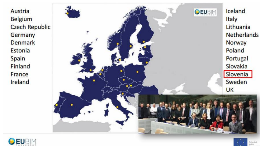
Figure 3 Members of EU BIM Task Group [53]

The inclusion of Slovenia in the EU BIM Task Group, which currently contains 21 members within the frame of European Commission (see Figure 3), represents yet another important milestone in furthering the introduction of BIM. The primary intention of this group is to unite national endeavors into a common and harmonized European methodology to digitalize the construction industry [53].