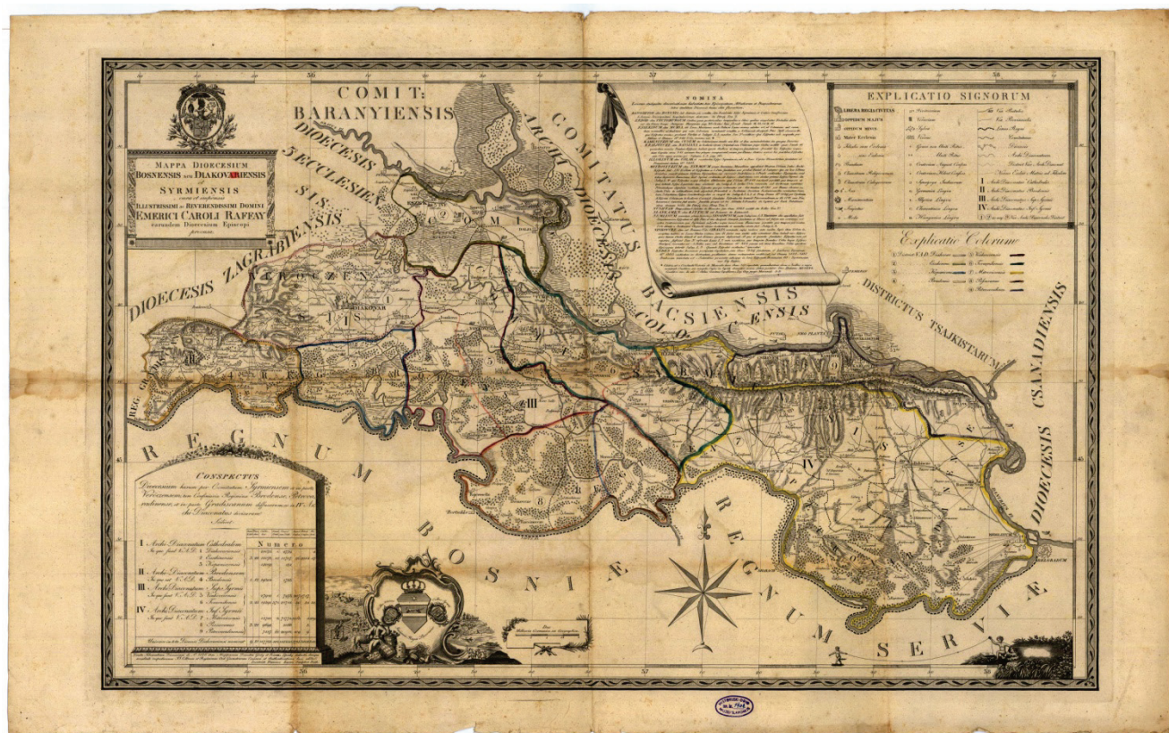
Figure 1 Scaled-down Map of the Bosnia or Đakovo and Syrmia Diocese [3]

The legend and the colour legend are placed in the upper right part of the map sheet. After printing the map was additionally coloured by hand in order of better noticing the existing deaneries (in Fig. 2 and Fig. 3, in Tab. 1 and Tab. 2). The applied symbols both for the ecclesial and the secular objects are replicative symbols [4].