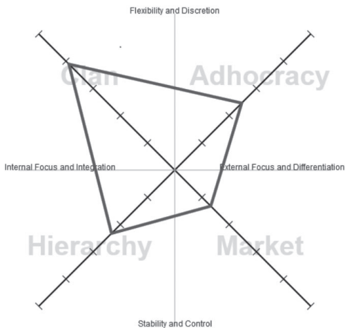
Figure 2. Surveyed students' preferences of the future employer's organizational culture

This means that they aspire to work in a company whose success is primarily the result of employee loyalty, tradition and mutual cooperation of all employees. Interpersonal relationships in companies with the clan organizational culture are based on caring for people (Cameron, 2004; www.ocai-online.com). Because of this, members of the clan culture tolerate the stresses of everyday business more easily, even the low salaries. In the clan culture, employees respect each other: workers see their managers more as mentors and management tends to take into account the opinion of all employees when making business decisions. In such companies, there is an overall atmosphere of mutual respect and support, which is actually the main source of job commitment of employees and their effectiveness. These results are presented in Figure 2 and Table 3.