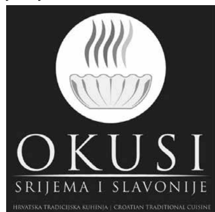
Figure 1 The symbol implemented for the regional local food of Eastern Croatia