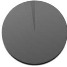
Chart 1 The relation of business commitments ratio and passive vacation ratio, as the motives of tourists' arrival to Istria